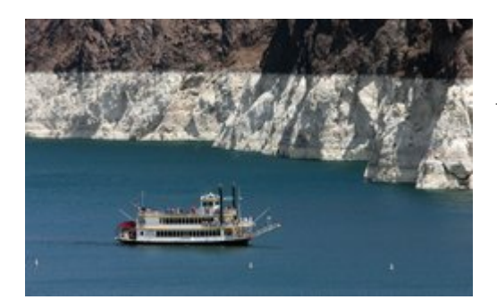
The white 'bathtub ring' on the rocks around Lake Mead is from mineral deposits left by higher levels of water.

Lake Mead is the largest reservoir in the US covering 640 km<sup>2</sup> with a capacity of 32.236 km<sup>3</sup> when full and is located on the Colorado River close to Las Vegas. It is the 16th largest man-made lake in the world and one of the largest man-made lakes in the Western Hemisphere. This sounds wonderful except that the lake has suffered drought for a number of years and scientists at the University of California-San Diego's Scripps Institution of Oceanography wrote a report in 2008 predicting that the lake has a 50% chance of running completely dry by 2021! http://scrippsnews.ucsd.edu/Releases/?releaseID=876